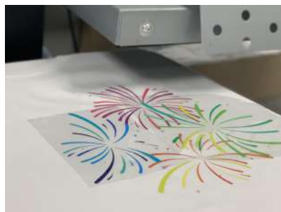
Transfer made with a SEFA press